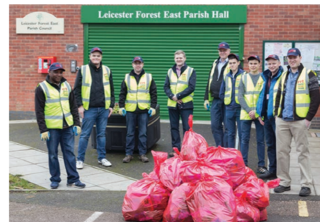
Covering the entire parish from Beggars Lane up to Braunstone Lane RRT volunteers walked the streets of