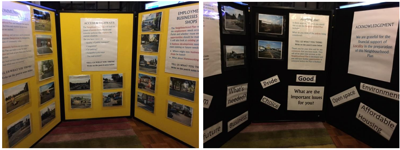
Having read the displays, attendees were asked to comment on each topic using post-it notes and to place them on flip-chart paper alongside each display.